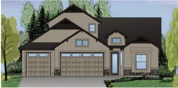
Elevation shows optional upper level bonus room.